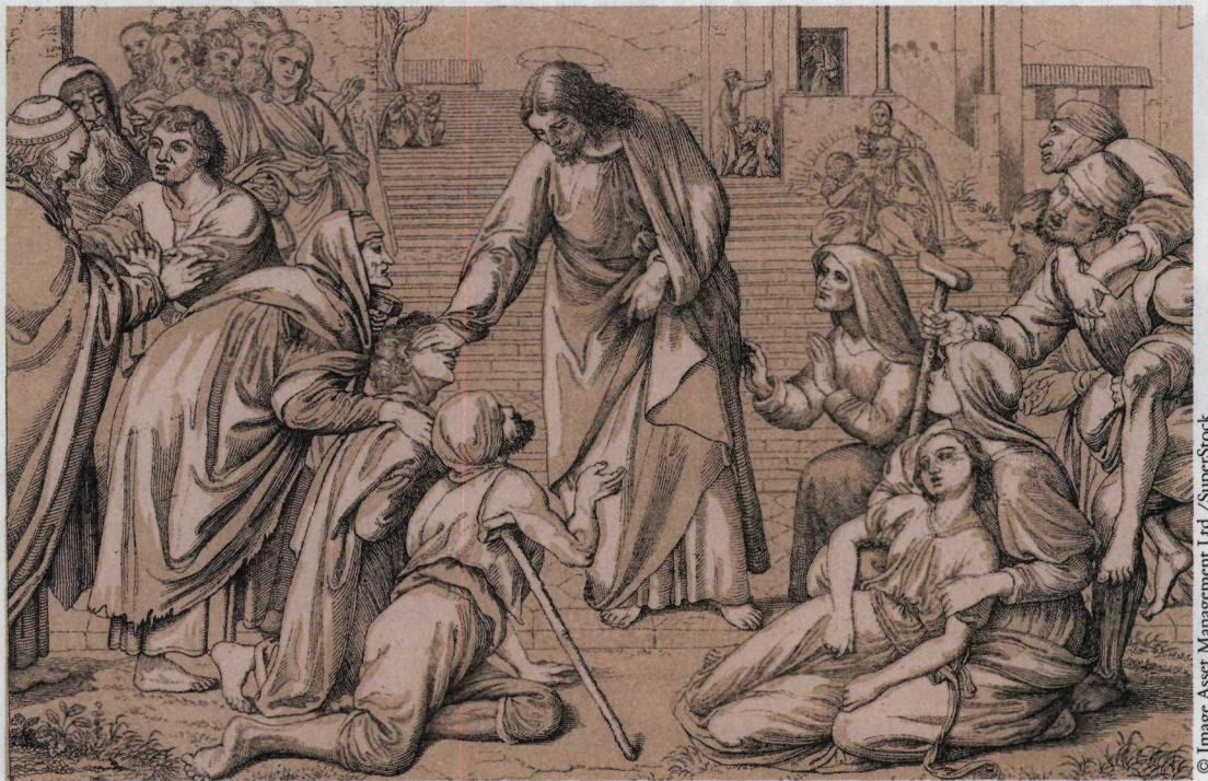
Jesus healing the multitudes. Wood engraving c1880.