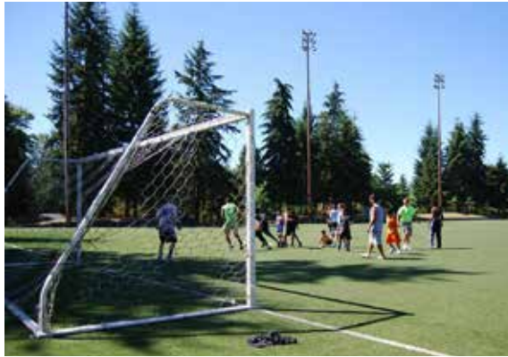
Westway soccer field

CHI’s Mission and Ministry Fund has provided more than $15 million in support to the program, which has blossomed to include 43 separate violence-prevention programs in every CHI community. Each works in partnership with