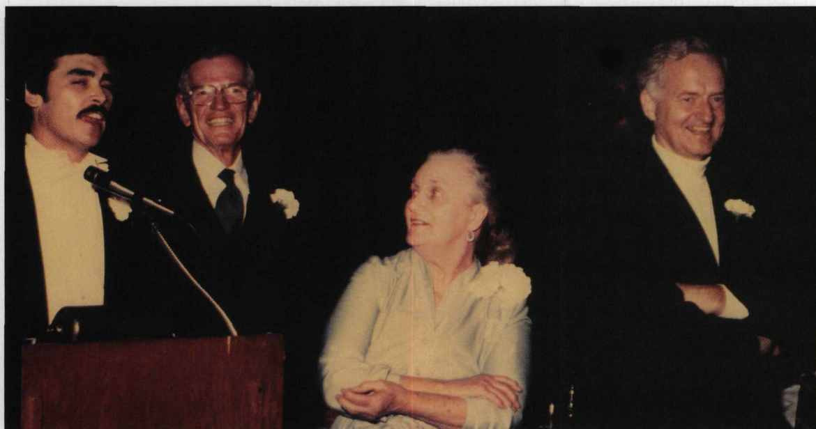
1978 , five-year service award at CHA.