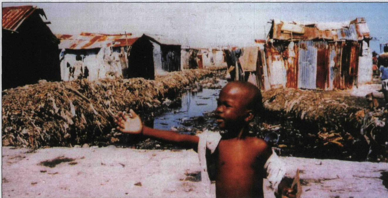
This Haitian child resides in the Cité Soleil village in Port-au-Prince. Children in this impoverished country are at high risk.

Even in the Haitian capital city of Port-au-Prince, most roads are impassable. Few residents have access to running water, sewage systems or electricity, and food is cooked using smoldering mountains of garbage as fuel. A mere two hours by air from the Florida coast, Haiti’s heartbreakingly high rates of maternal, infant and child mortality, HIV/AIDS and malnutrition create a particularly bleak outlook for the country’s littlest residents. Haiti ties for the worst calorie deficit in the world, with the average citizen consuming only 460 calories per day. Many families are able to provide their children with only one meal — every other day. According to the World Food Programme, poor nutrition has stunted the growth of more than 40 percent of Haitian children 5 years old and under; other reports indicate that only roughly half of Haiti’s children survive to celebrate their fifth birthdays. Young lives are