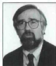
are available from

Cancer Treatment In the next five years, we will see major advances in identifying persons at risk for certain cancers. These advances have already begun with both breast and colon cancer. Cancer, in many respects, is a genetic disease. Cancer is created by a series of genetic errors in the somatic cells of our body. Researchers at Johns Hopkins have shown that colon cancer is the result of five to seven different genetic errors that shut down certain protective mechanisms; when they've all failed over 50 to 60 years as cells divide, the result can be a form of cancer. Cancer happens because of changes in the DNA