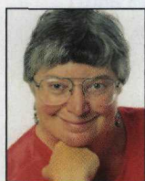
BY EMILY FRIEDMAN

Just as Nuclear Threats Continue to Influence Foreign Policy, the Ghosts of Past Efforts to Improve the U.S. Health System Still Trouble Us