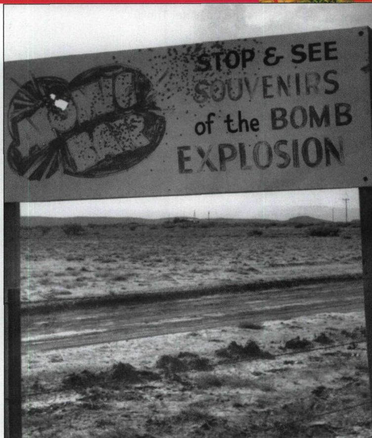
A sign at the Trinity test site, Alamogordo, N.M.

Further, in this age of "healthy communities," it is important to remember that health status is affected by social factors, many of which are beyond the power of the individual to counter. These include poverty, poor and unsafe housing, violence (domestic, street, etc.), firearms, insuffi-