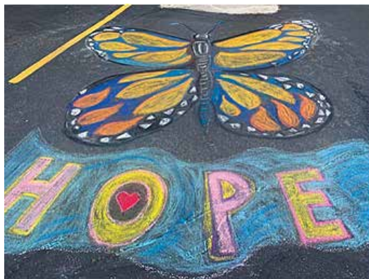
To provide an encouraging message to staffers arriving around the clock at Mary Immaculate Health/Care Services in Massachusetts, a walkway was marked with chalk art featuring a butterfly and the word HOPE.