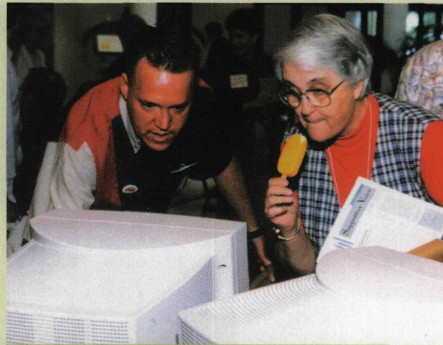
Explorations in Cyberspace At the assembly's CyberCafé, members were treated to demonstrations of CHA's Web site, help in surfing the Internet, and ice cream.

These concerns often are not addressed because staffing is not sufficient, and workers must find ways to cut corners to be able to complete their assigned duties. With adequate staffing, aides have time to meet residents' individual needs.