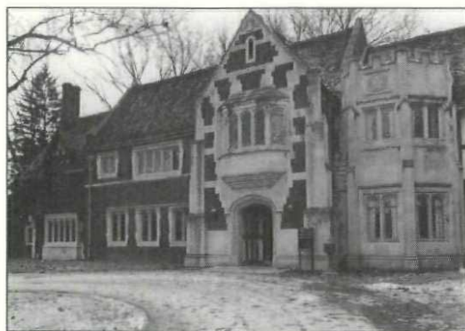
Franciscan Wholistic Health Center