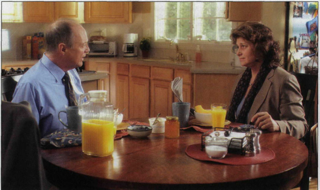
The fictional TV couple Harry and Louise returned to the airwaves to promote health care reform, a reversal in message from their commercials in the 1990s.

“I’m glad to see Harry and Louise are back,