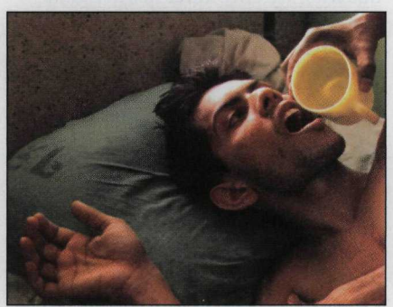
Kind hand with a cup, a nurse offers water to a patient at a rehabilitation center in rural Bangladesh. The center treats stroke victims and patients with spinal cord injuries, a common occurrence for the poor here, who spend long days in hard manual labor.