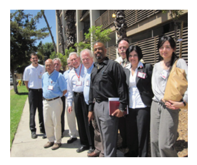
Catholic Healthcare West's Northridge Hospital Medical Center Green Team.