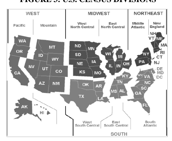
FIGURE 3: U.S. CENSUS DIVISIONS

CMS finalizes its proposal, with modification, to define "region" as one of the nine U.S. Census divisions, as shown in Figure 3 below.